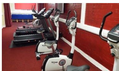
Call us to book an induction at our gym