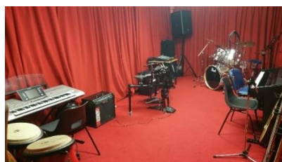
Hire our excellent music room- call for info