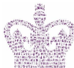
The Queen's Award for Voluntary Service