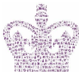
The Queen's Award for Voluntary Service