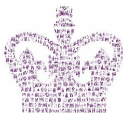
The Queen's Award for Voluntary Service