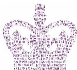
The Queen's Award for Voluntary Service